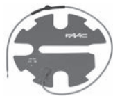
Pit heater JH275 (to extend operation down to -25°C)