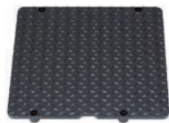
Pit cover JC275