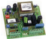
Electronic control board 200MPS Info at page 154 790905