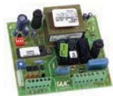
Electronic control board 200MPS Info at page 154 790905