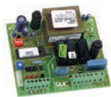
Electronic control board 200MPS Info at page 156