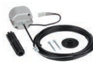
Electric brake Kit ♦