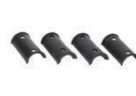
Pole adapter 60 > 48/42 mm